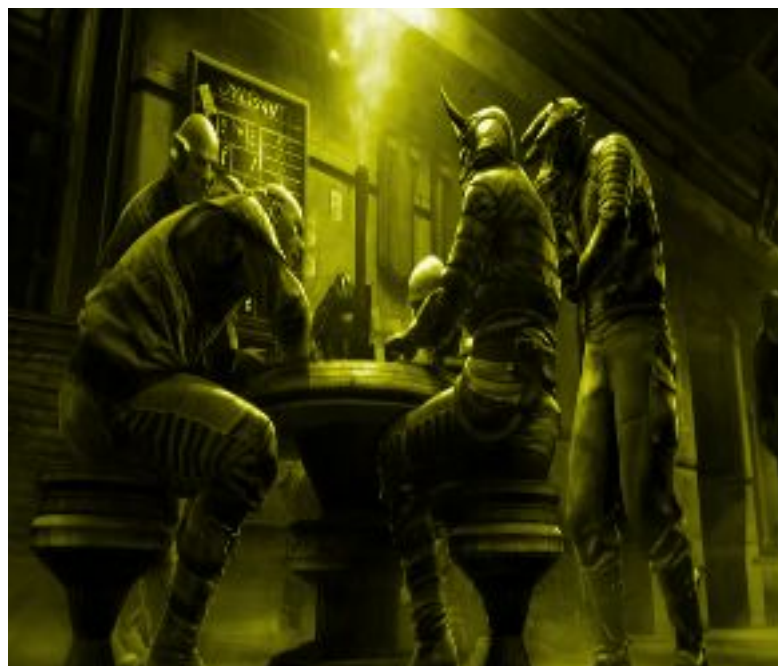
Figure 2.4 An Illegal betting ring, Believed to have been organized by Bellico Clermont (participants unidentified). Taken in the Korda Underground, Jaspar's Tavern, via droid surveillance. Droid # [REDACTED]-ECG "[REDACTED]"